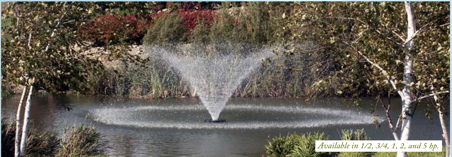
Available in 1/2, 3/4, 1, 2, and 5 hp.

For over 4 decades, Kasco has been manufacturing aeration products proudly in the U.S.A. Our customer-focused philosophy ensures that you get superior performance at a great value. Improve the overall water quality and smell of your pond, while enhancing its appearance.